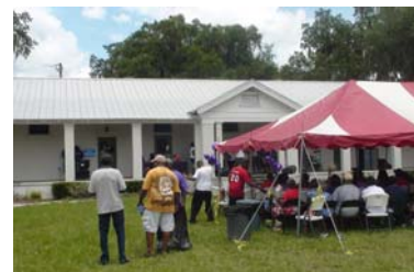
VBS KICK OFF SATURDAY JUNE 6TH

Get involved and enjoy the summer. There’s no place like home.