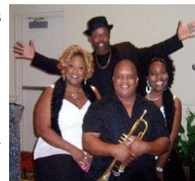
An evening Gala with Semi Formal Attire featuring the Music Makers!!!

Deadline is June 17th. Tickets are $35.00 per person.