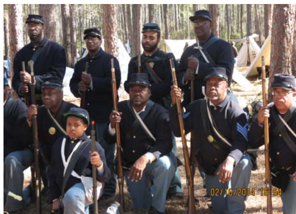
Volunteers reenact a scene from the Civil War with Union Army 2nd Infantry United States Colored Troops Regiment

Celebration activities such as a reception, Friday BBQ Competition, Vendors, Reenactment, Storytellers, Exhibits, an Evening Gala and Faith Service. There are more exclusive events to allow participants time to